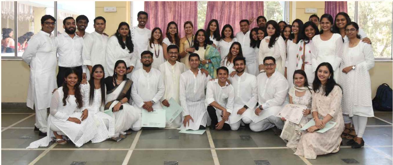
Degree Distribution Ceremony