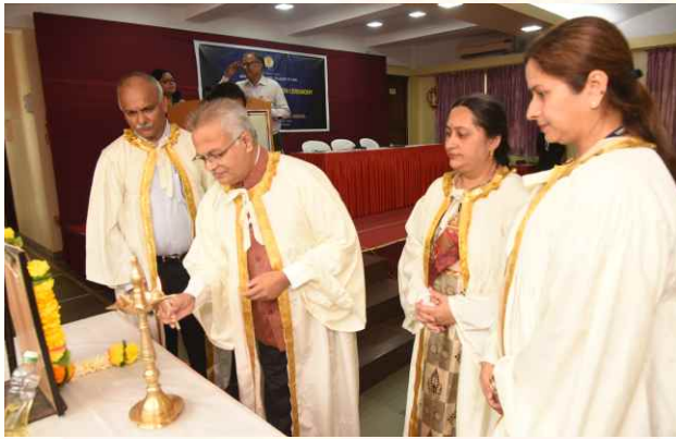
Dignitaries at the Degree Distribution Ceremony